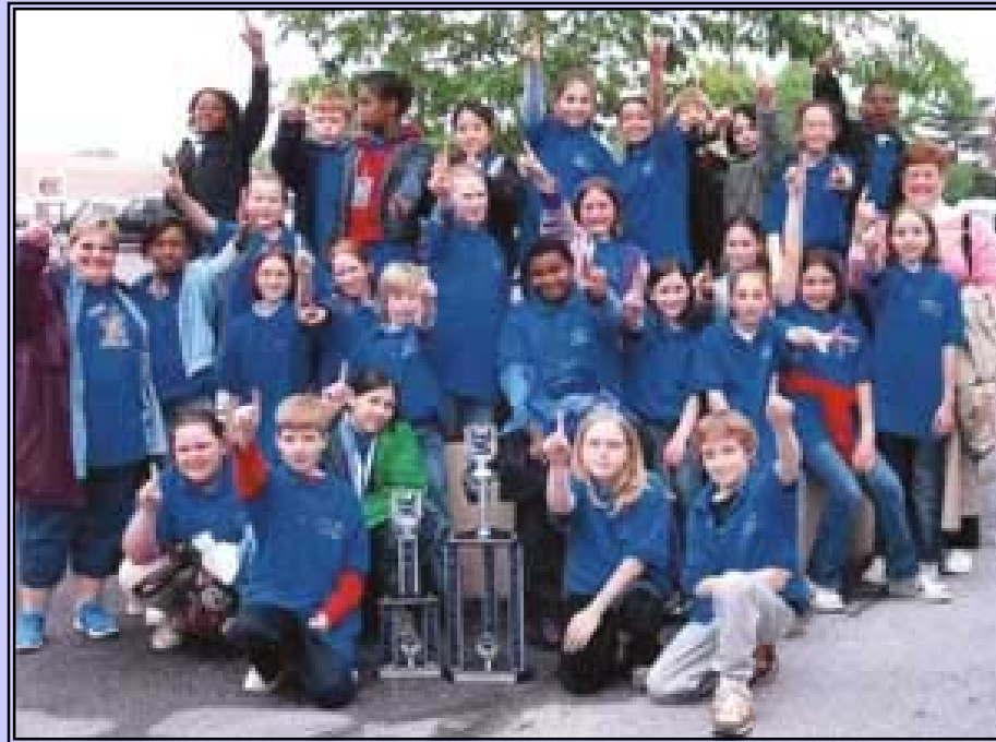
The Chapel Hill Music Sensations after singing the National Anthem at Ripken Stadium in July, 2005

Prepared by the Baltimore County Public Schools Northeast Area Office and the Office of Strategic Planning July 2006